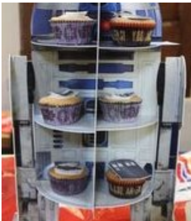
The Force is with us!