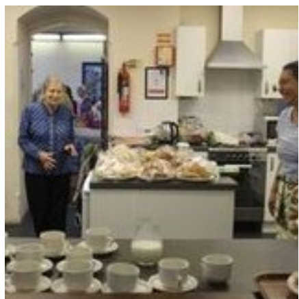
Lunch is ready.